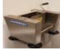
SMS - 60