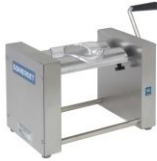
SPM - 45